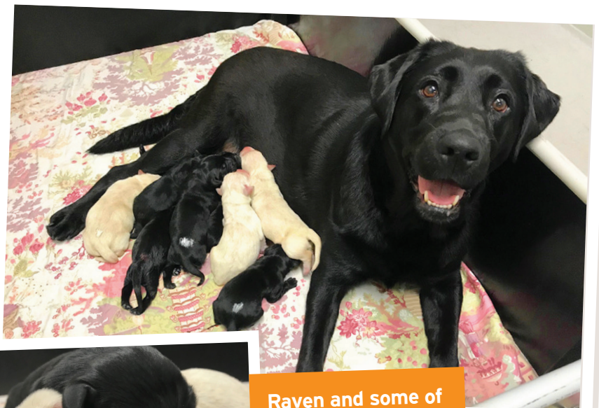
Raven and some of her nine puppies.

Two yellow males one yellow female Three black males Three black females