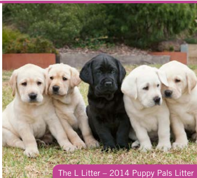
The L Litter – 2014 Puppy Pals Litter